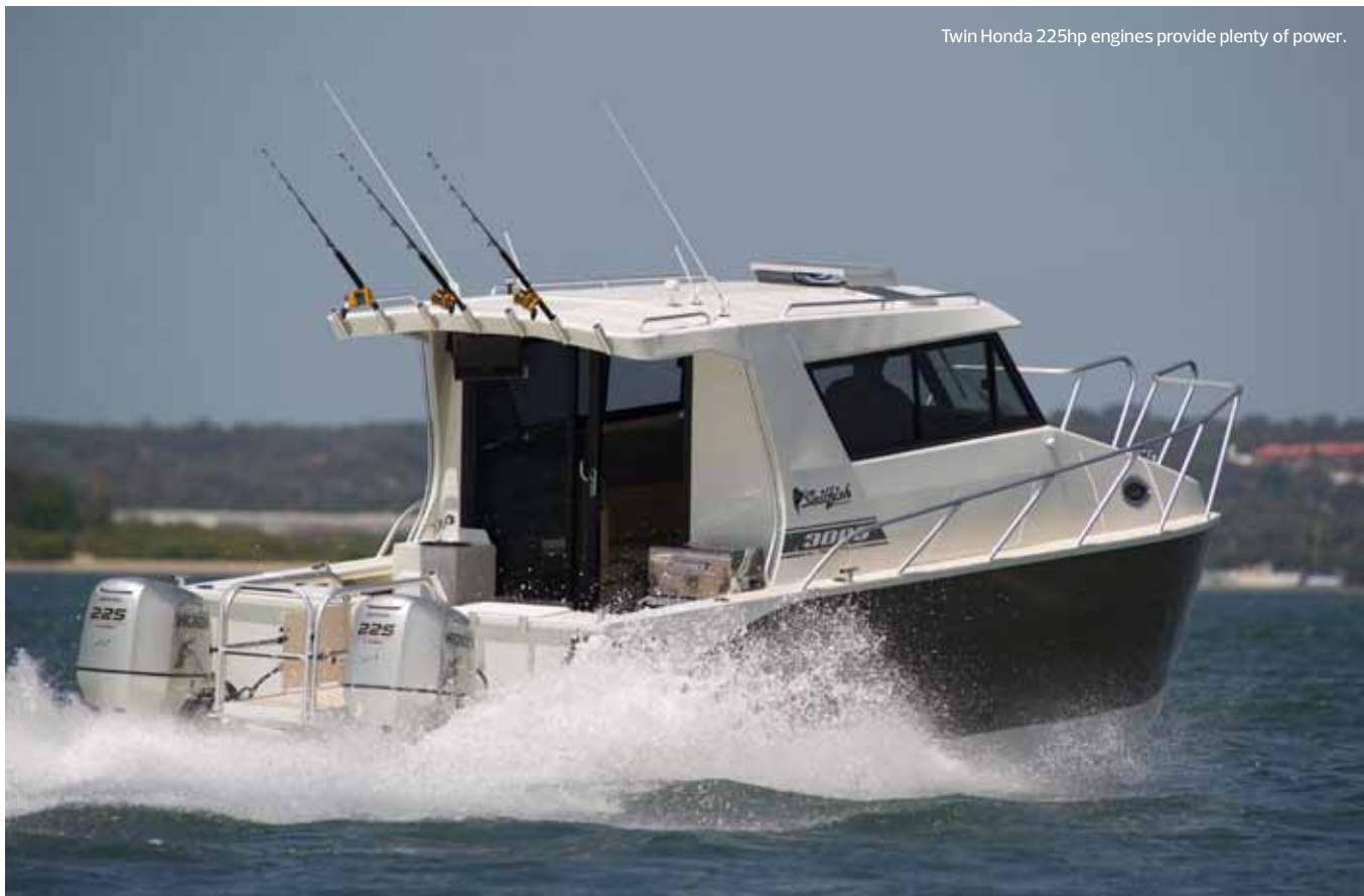
Twin Honda 225hp engines provide plenty of power.

Our test took place on Botany Bay with a healthy chop so I was interested to see what the twin hulls could do with relatively easy-going conditions. As we pulled out of the no-wash zone, Ash got the boat up to 40-knots in less than seven seconds. Sitting up at the helm I really thought I was steering a tank. It even looked like a tank from the support boat. Stick a couple