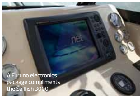
A Furuno electronics package compliments the Sailfish 3000

touch for the anglers: a direct linked screen to the sounder tucked into the corner under the hard-top roof so you can be in touch even as you fish off the rear deck.