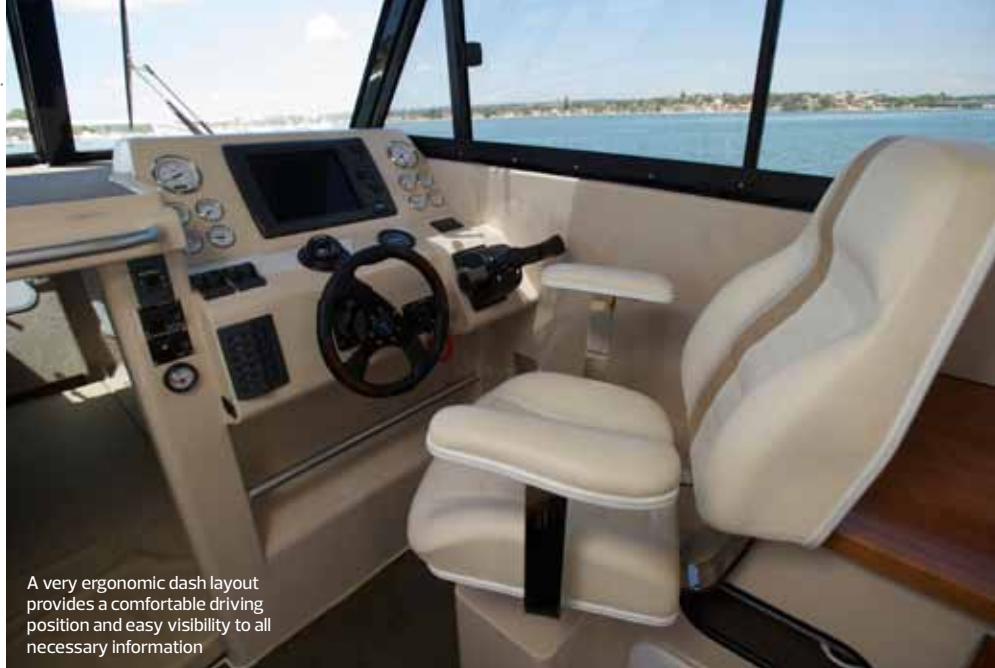
A very ergonomic dash layout provides a comfortable driving position and easy visibility to all necessary information

At the stern there is a really nice touch in that the manufacturers have built a transom walkway that juts right out and runs parallel with the outboards. At the end there is a ladder for getting in and out of the boat. I would love to have this when a marlin is hooked and you want to quickly bring the fish close and unhook it with the minimum of fuss. It also plays a big part when the family wants to snorkel or play in the water. The rear deck is spacious and has all the things you would expect from a boat like this: a transom and deck wash; live-bait tank; kill tank; rod holders running parallel with the gunwale (starboard side only); transom icebox; tackle boxes and two padded seats that tuck into the corners port and starboard. There is also a barbecue and wash sink on opposite corners and a