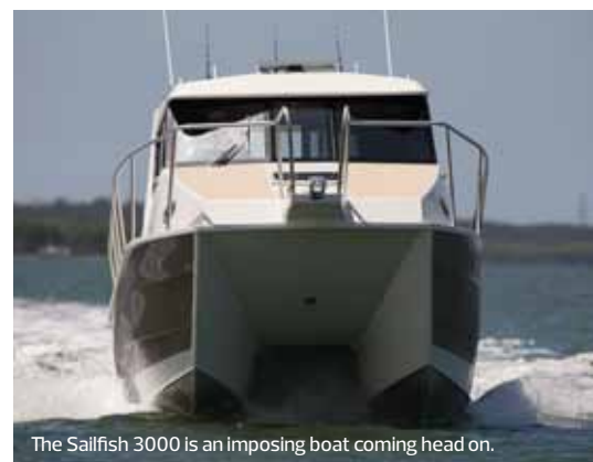
The Sailfish 3000 is an imposing boat coming head on.

Performance from the twin hulls is competitive – if not better than V-hulls. I base this assumption on the fact there is less drag and friction and therefore less fuel needed to move the boat. The design can be compared to a knife-and-spoon effect. The mono hull has a much larger surface area, compared to the knife of a catamaran. My test, albeit brief, had my calculations running about 18-litres per hour, per engine at 4000rpm. That's a speed of about 30-knots. This translates into a range of 700km with a full tank of 700-litres. The tank system runs on twin 350-litre tanks. You might get a touch more but I would never promote unrealistic figures when it comes to the range of a boat, just in case. Running figures are as follows: 3000rpm – 20-knots; 4200rpm – 30-knots; 5800rpm – 43-knots (top speed).