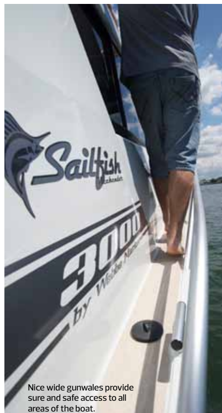
Nice wide gunwales provide sure and safe access to all areas of the boat.

Starting at the bottom and working upwards, the sponsons are made from 5mm alloy and are box-sectioned with foam fillers for damping and flotation. The sides of the boat use 3mm alloy sheet, wrapped around the hull using a jig system. I am reliably informed there is no bog used, which adds to that aforementioned company ethos.